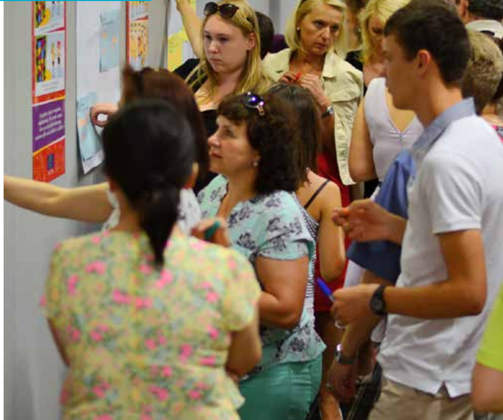
Presenting their school projects. Participants at the National Conference of the Schools for Democracy Programme in Ukraine.